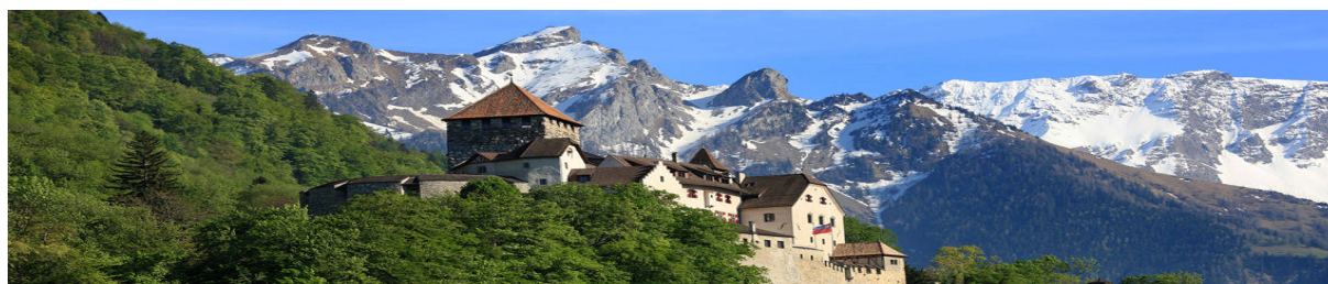
Castle of Liechtenstein in Vaduz